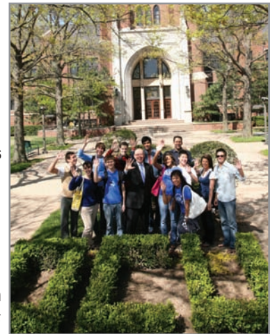
OCU is located on a 42-hectare park-like campus in central Oklahoma City. The university's high number of international students add to a culture of diversity.