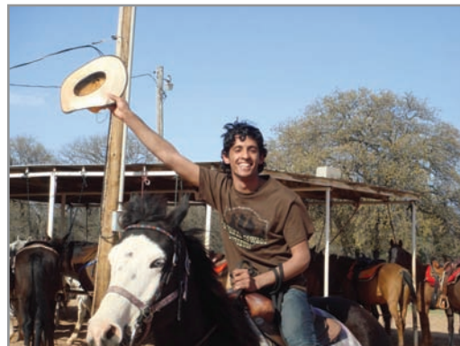
Students can enjoy horseback riding or attending a rodeo in Oklahoma City. ELS/ Oklahoma City arranges field trips to these and other great activities throughout each session