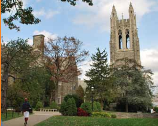
Saint Joseph's University, a private, coeducational Roman Catholic Jesuit university, was founded in 1851 and is home to ELS/Philadelphia.

c/o Saint Joseph's University 5414 Overbrook Avenue Philadelphia, PA 19131 T: +1.215.473.4430 F: +1.215.473.3220 www.ELS.edu/philadelphia www.sju.edu/els www.USAAUniversityGuideOnline.org/sju phi@els.edu