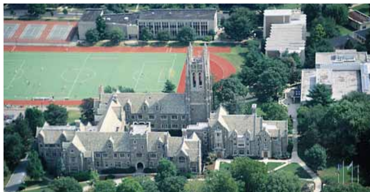
Aerial view of Saint Joseph's University in Philadelphia, Pennsylvania.