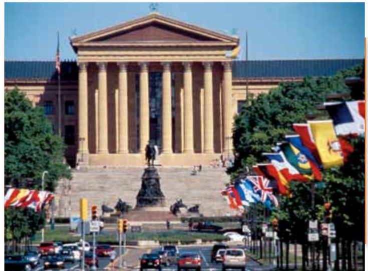
The Philadelphia Museum of Art describes itself as "one of the largest museums in the United States." Its collections include more than 225,000 objects. The Museum houses more than 200 galleries spanning 2,000 years of history.