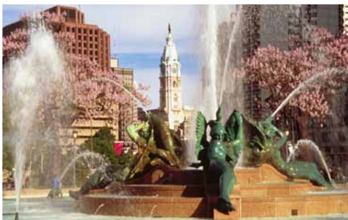
The City of Philadelphia is home to many water fountains, including the Swann Memorial Fountain.