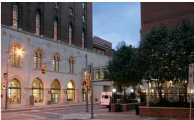
Lawrence Hall contains residence halls, offices and classrooms.