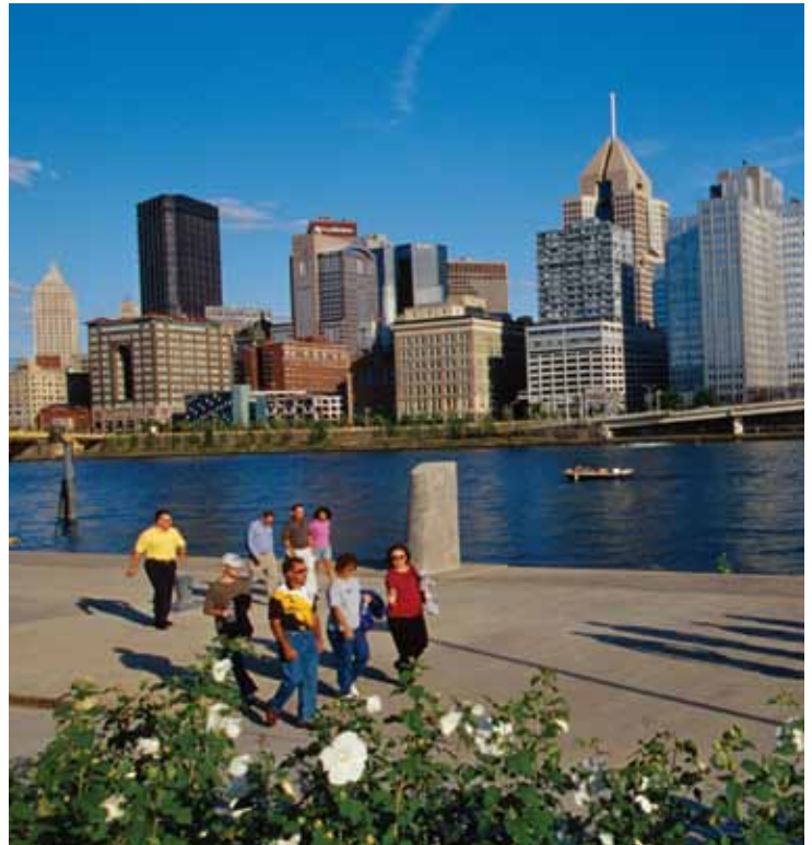
View of the Pittsburgh skyline from across the river.