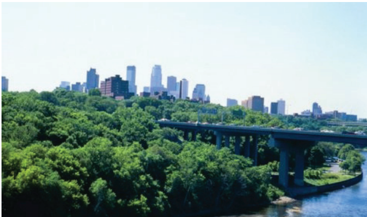
St. Paul is the capital and second-most populous city of the US state of Minnesota. The city lies mostly on the north bank of the Mississippi River, and adjoins Minneapolis, the state's largest city. Known as the "Twin Cities", these two cities form the core of Minneapolis-St. Paul.