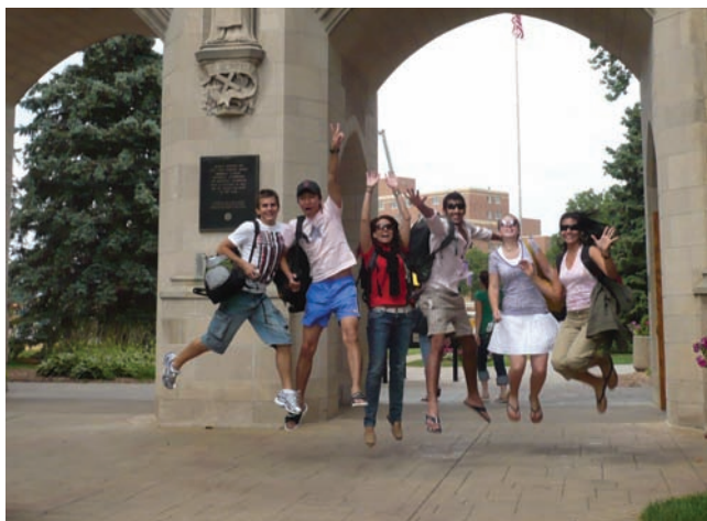
The University of St. Thomas is a Catholic, comprehensive university that fosters a tradition of service to the public and an energetic, thoughtful approach to the challenges of contemporary life. UST is the largest private universities in St. Paul, with a student body of close to 11,000 and over 300 students from more than 69 countries.