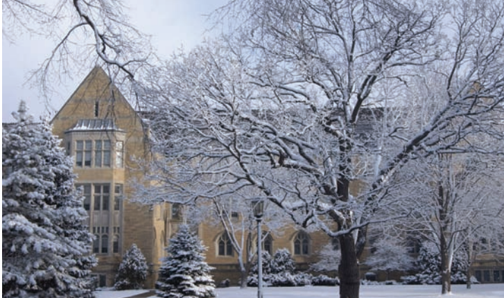
In winter months, St. Paul is active with the Saint Paul Winter Carnival, a tradition originating from 1886 when a New York reporter called Saint Paul "another Siberia." Attended by 350,000 visitors annually, the event showcases ice sculpting, an annual treasure hunt, winter food, activities and an ice palace.